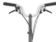
H Type (High)

Choosing a bike is about making sure it's right for you. The right fit for your height, and the right style for the riding position you want.