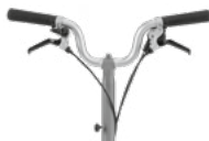
M Type (Medium)