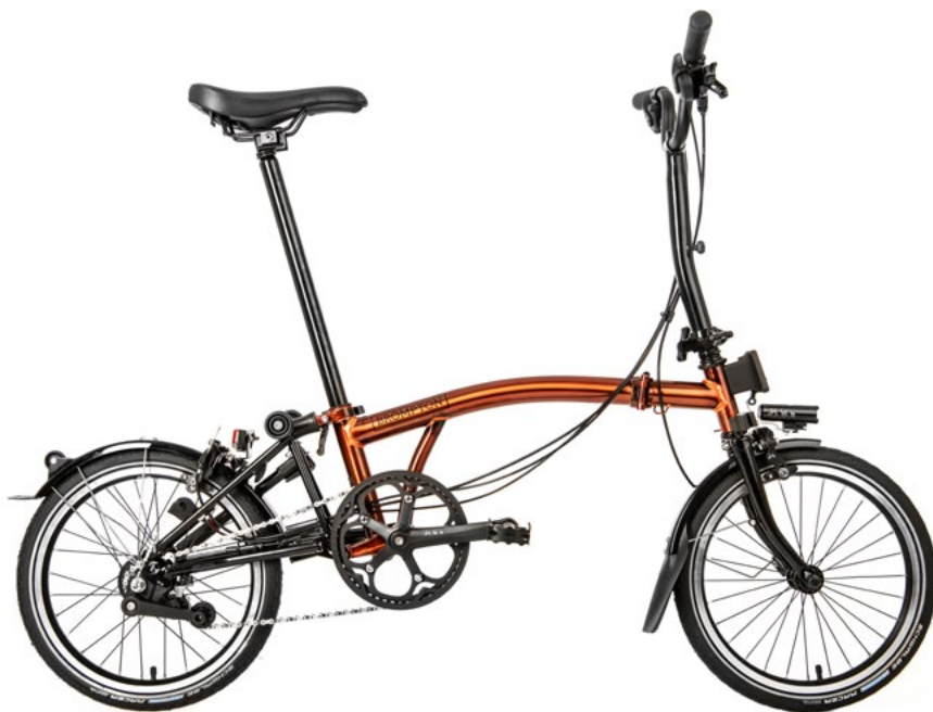
Flame Lacquer (new for 2021)